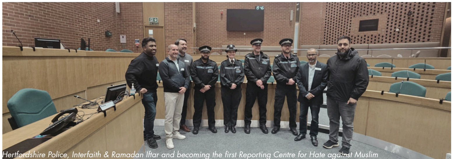
Hertfordshire Police, Interfaith & Ramadan Iftar and becoming the first Reporting Centre for Hate against Muslim