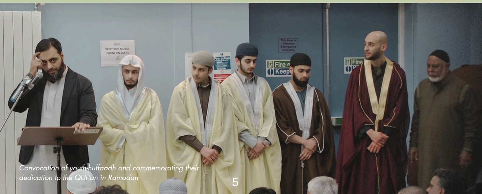
Convocation of youth-huffaadh and commemorating their dedication to the Qur'an in Ramadan

An investment that reaches you in the grave, elevates you in the hereafter, and transforms lives in the meantime. Give with intention. Support with conviction. Be part of a legacy that outlives us all.