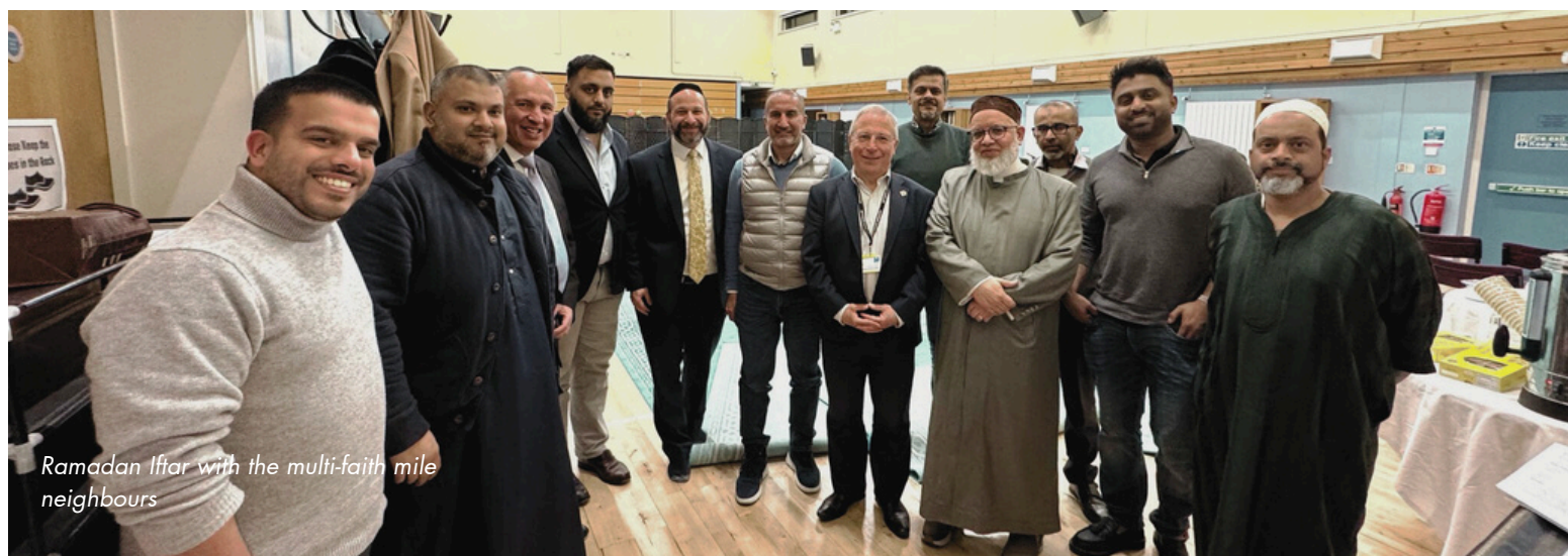
Ramadan Iftar with the multi-faith mile neighbours