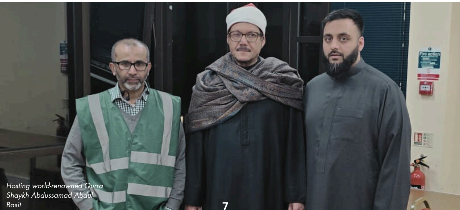
Hosting world-renowned Qurra Shaykh Abdussamad Abdul Basit