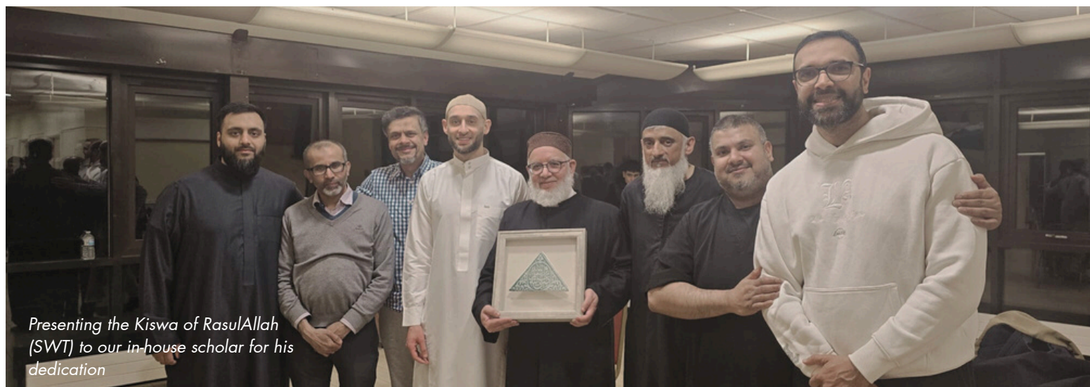
Presenting the Kiswa of RasulAllah (SWT) to our in-house scholar for his dedication