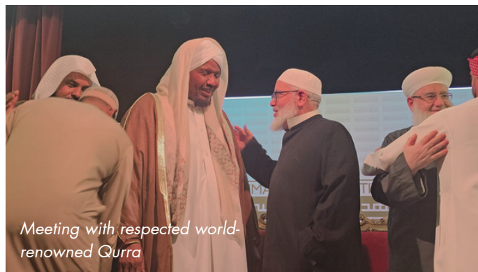
Meeting with respected world-renowned Qurra