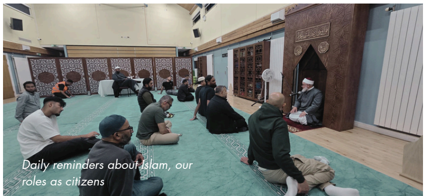
Daily reminders about Islam, our roles as citizens