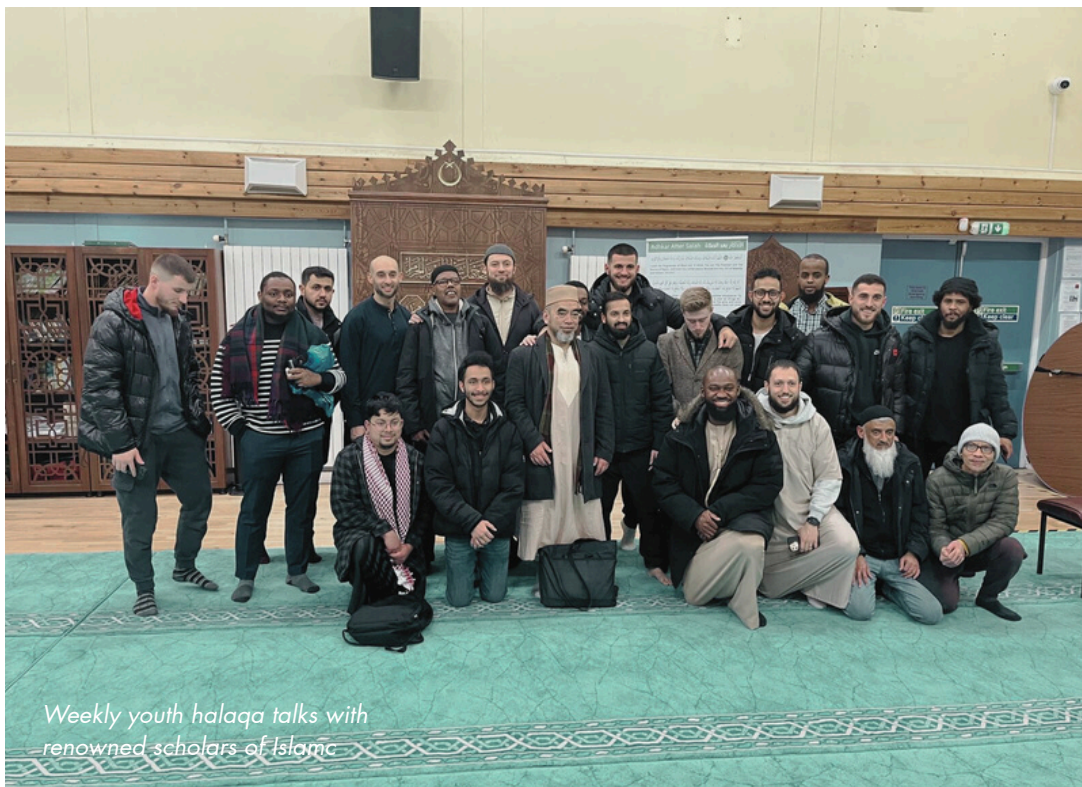
Weekly youth halaqa talks with renowned scholars of Islam