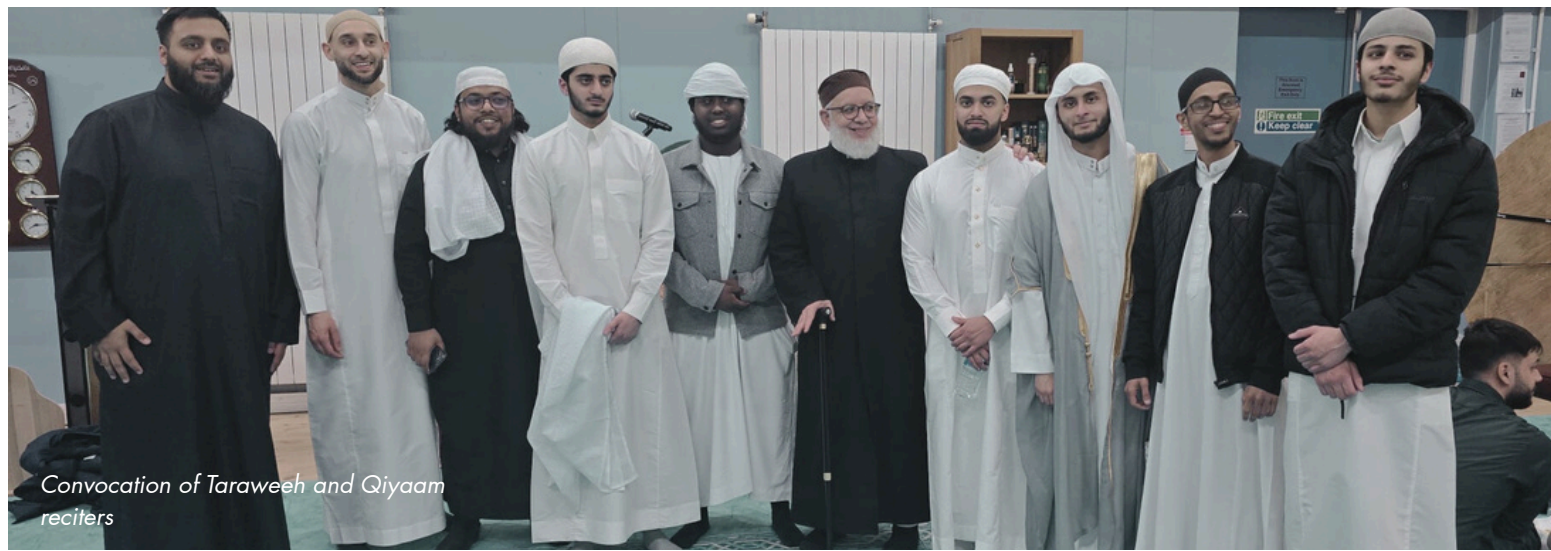
Convocation of Taraweeh and Qiyaam reciters