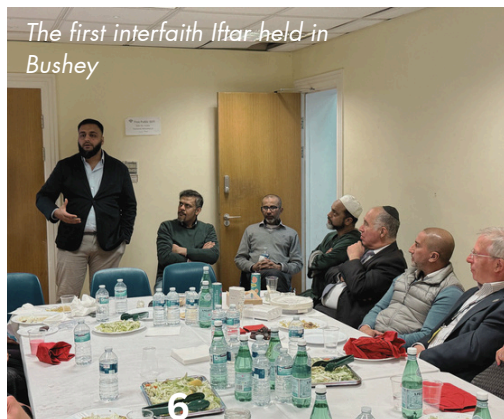
The first interfaith Iftar held in Bushey