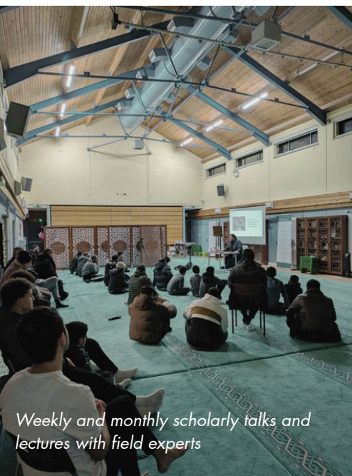
Weekly and monthly scholarly talks and lectures with field experts