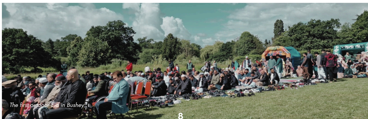
The first outdoor Eid in Bushey