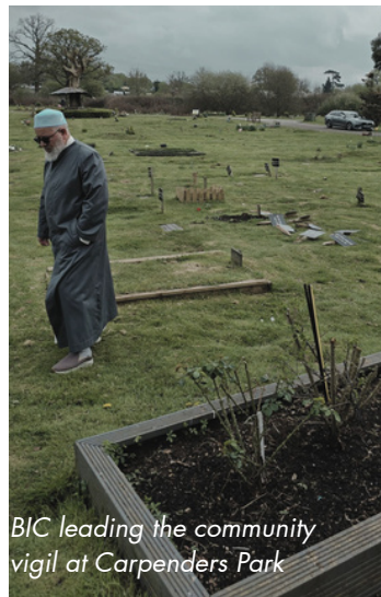
BIC leading the community vigil at Carpenders Park