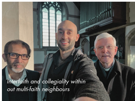
Interfaith and collegiality within out multi-faith neighbours